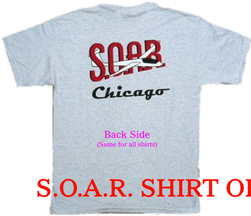
Back Side (Same for all shirts)